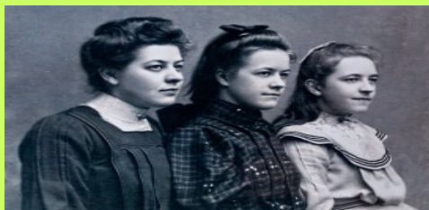
Betsie, Nollie & Corrie ten Boom