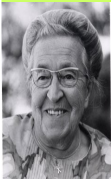
Corrie ten Boom